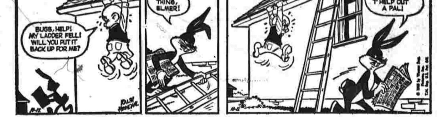
BIGGS BUNNY BY V. T. HAMLIN