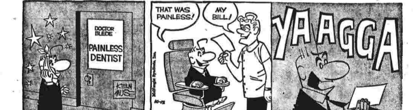
WAYOUT BY KEN MUSE