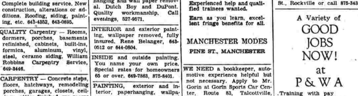
A VARIETY OF GOOD JOBS NOW! BY FAGALY and SHORTEN