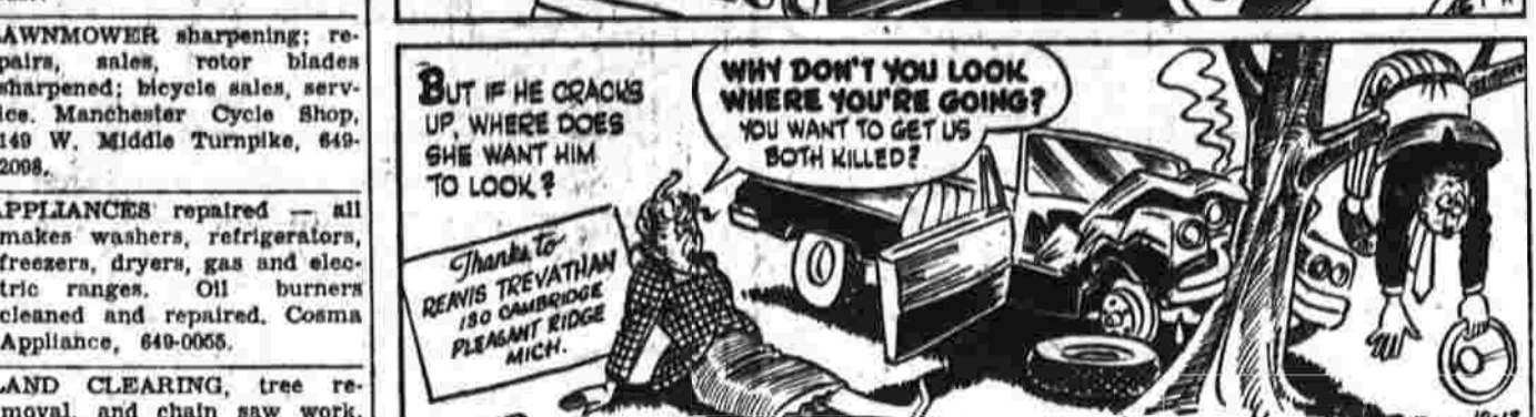
WIN DON'T YOU LOOK BY FAGALY and SHORTEN