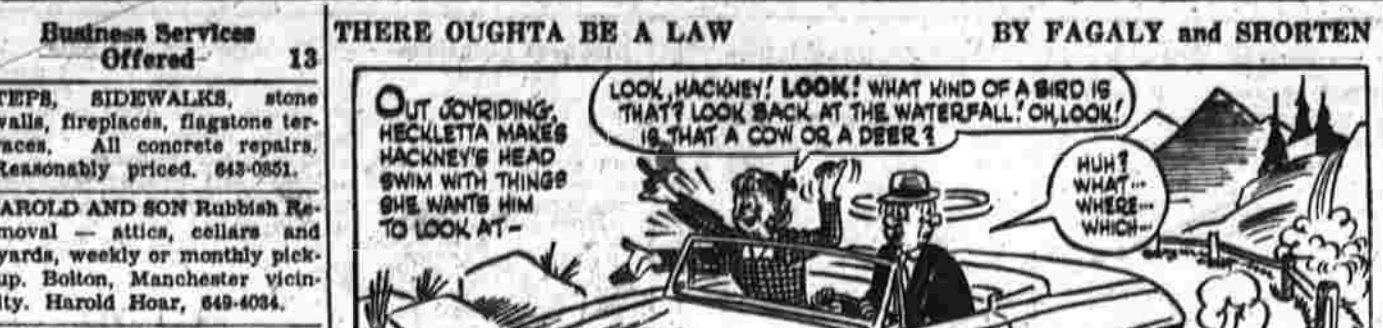
THERE OUGHTA BE A LAW BY FAGALY and SHORTEN