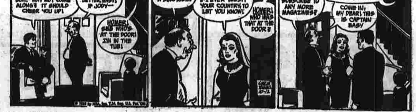
MICKY FINN BY LANK LEONARD