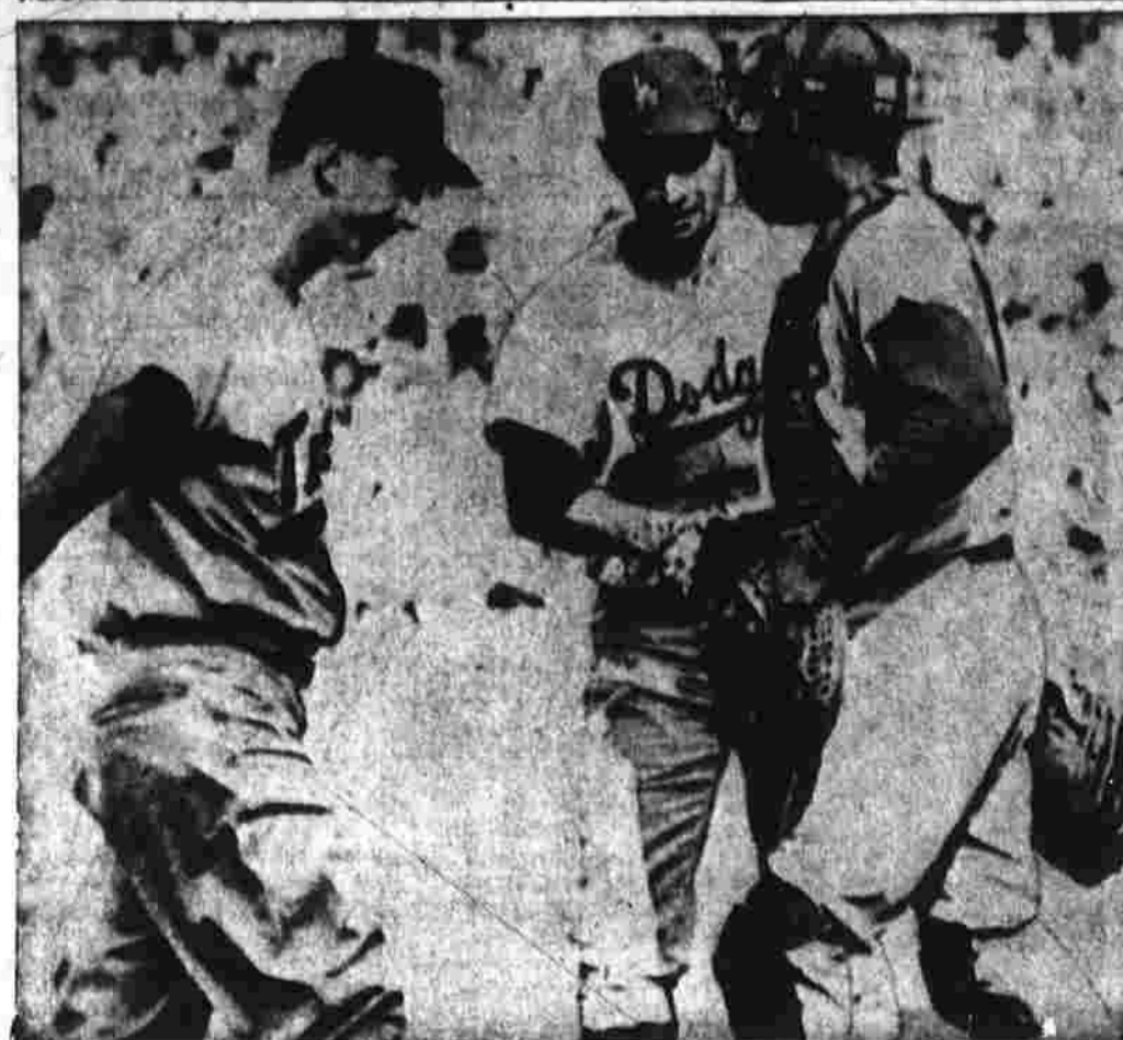
HE LOST AND THEY WON—Minnesota Coach Billy Martin walks glumly toward Twins dugout as Dodgers' Sandy Koufax and Johnny Roseboro shake hands following win.