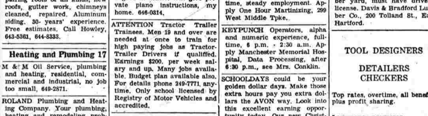
HARTFORD COURANT BY FAGALY and SHORTEN