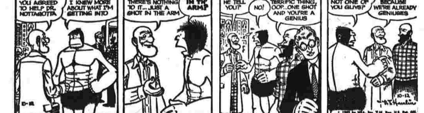
ALLY OOP BY V. T. HAMLIN