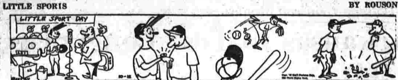
LITTLE SPORT BY ROUSON