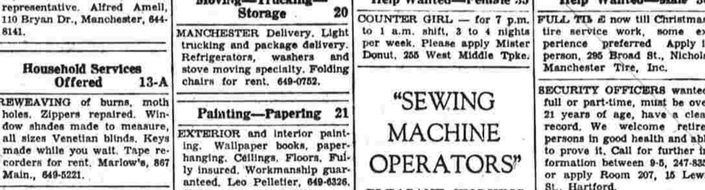
SEWING MACHINE OPERATORS BY FAGALY and SHORTEN